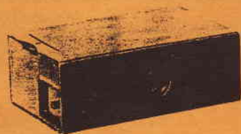
MATCHBOX CAMERA - 1944-45.

Answer: EKC's Matchbox Camera, a simple metal and plastic camera shaped like a matchbox Made for the Office of Strategic Services. 1/2 x 1/2" exposures on 16mm film. Rare! $2800-4000. (From 11th Edition of McKeown's Price Guide to Antique & Classic Cameras 2001-2002)